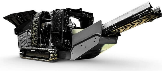
SC 5030 Vibrating Screener