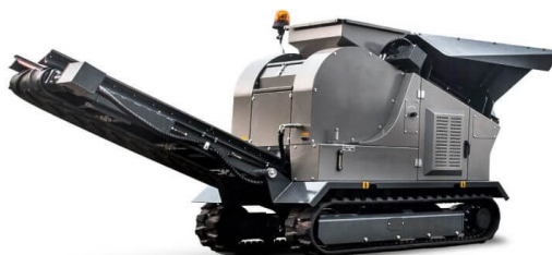
K-JC 503 Jaw Crusher