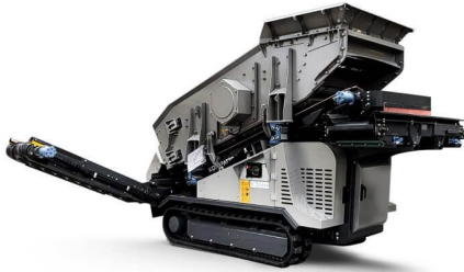
SC 221 Vibrating Screener