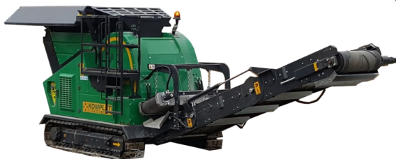
LT 7040 Jaw Crusher