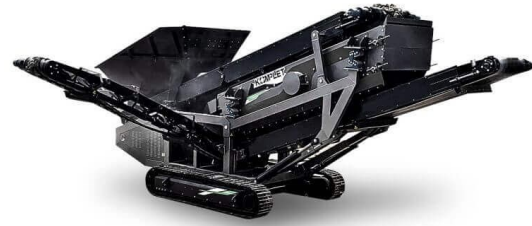
Kompatto 104 Vibrating Screener