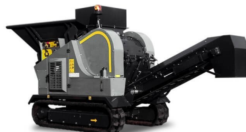
MT 5000 Mobile Hammer Mill