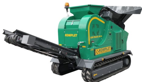
LT 4825 Jaw Crusher